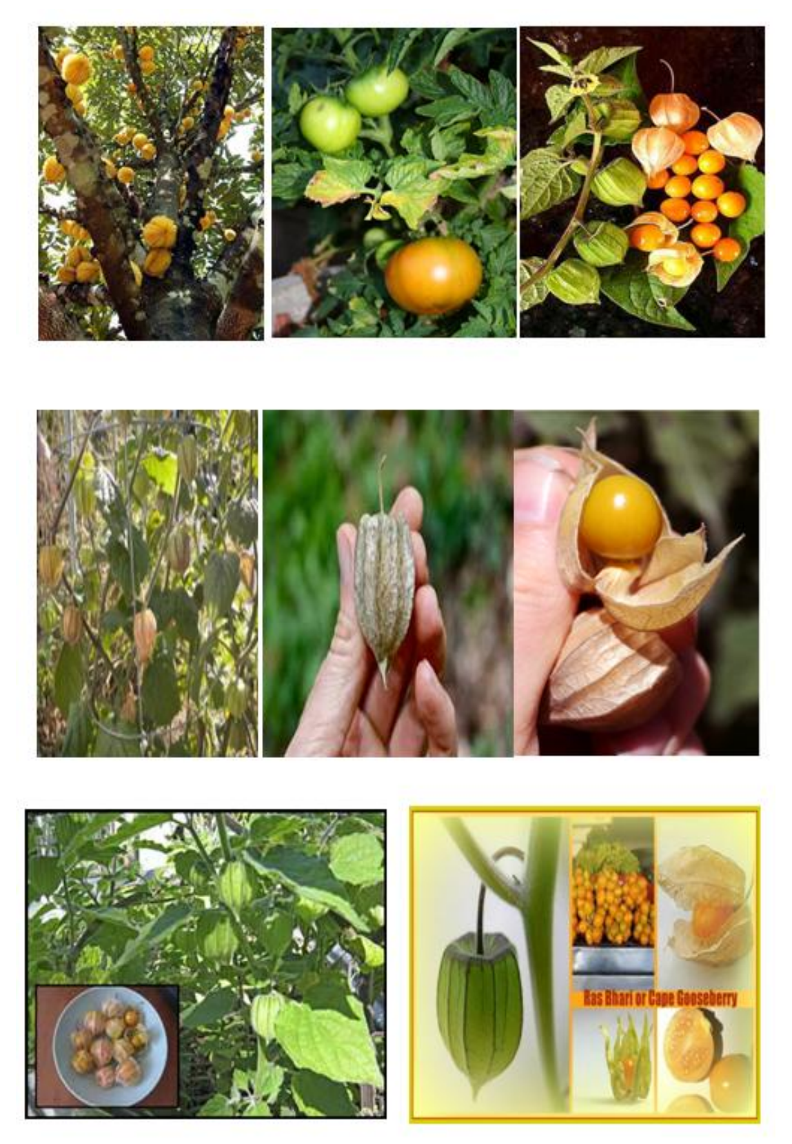
Figure 1. Physalis peruviana Plant with Fruits.